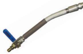
MPI-0370 Fan Spray Wand