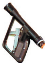
MPI-0360 Trigger Spray Gun