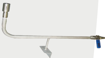
MPI-0350 Wine Barrel Wash Wand