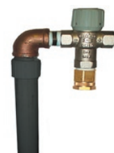
MPI-0380 Hot Water Protection Device (Installs at water inlet)

For more information please visit us at www.delozone.com